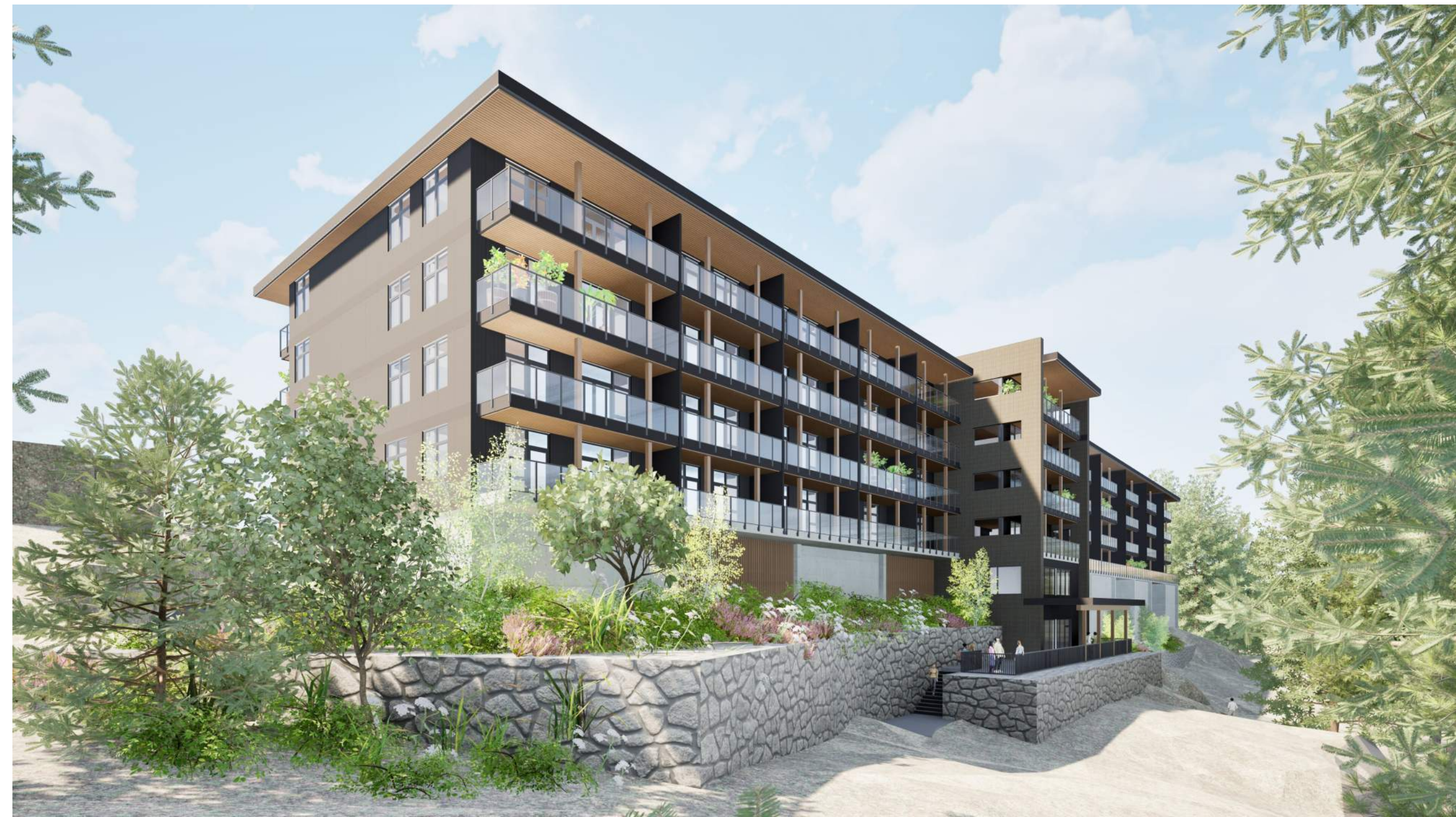
RENDERING OF NORTH - EAST BUILDING ELEVATION