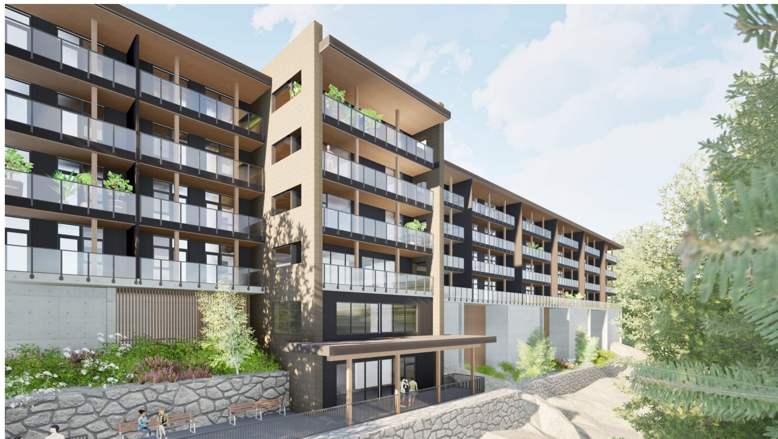
RENDERING OF NORTH BUILDING ELEVATION AND AMENITY SPACE