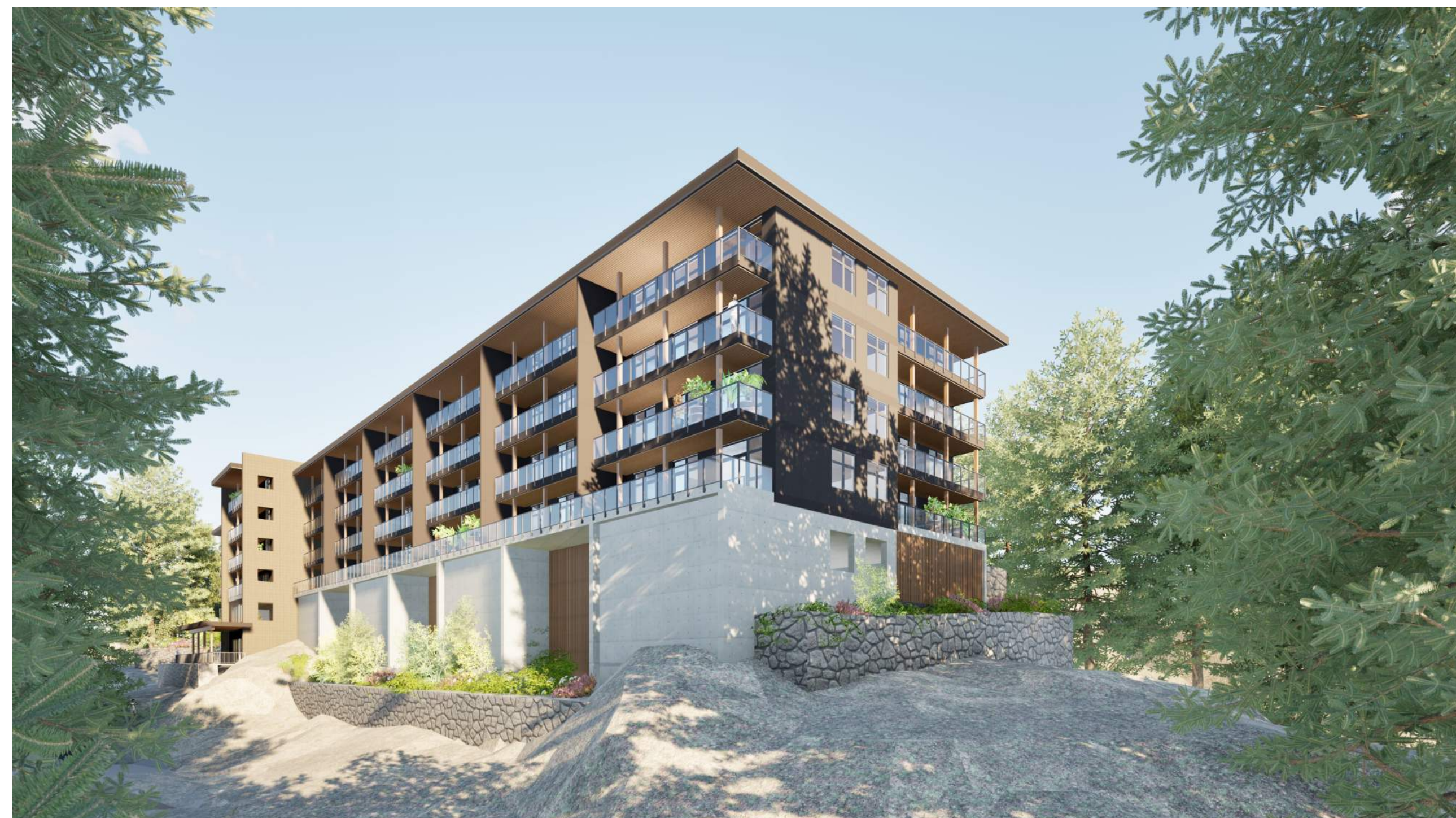
RENDERING OF NORTH - WEST BUILDING ELEVATION