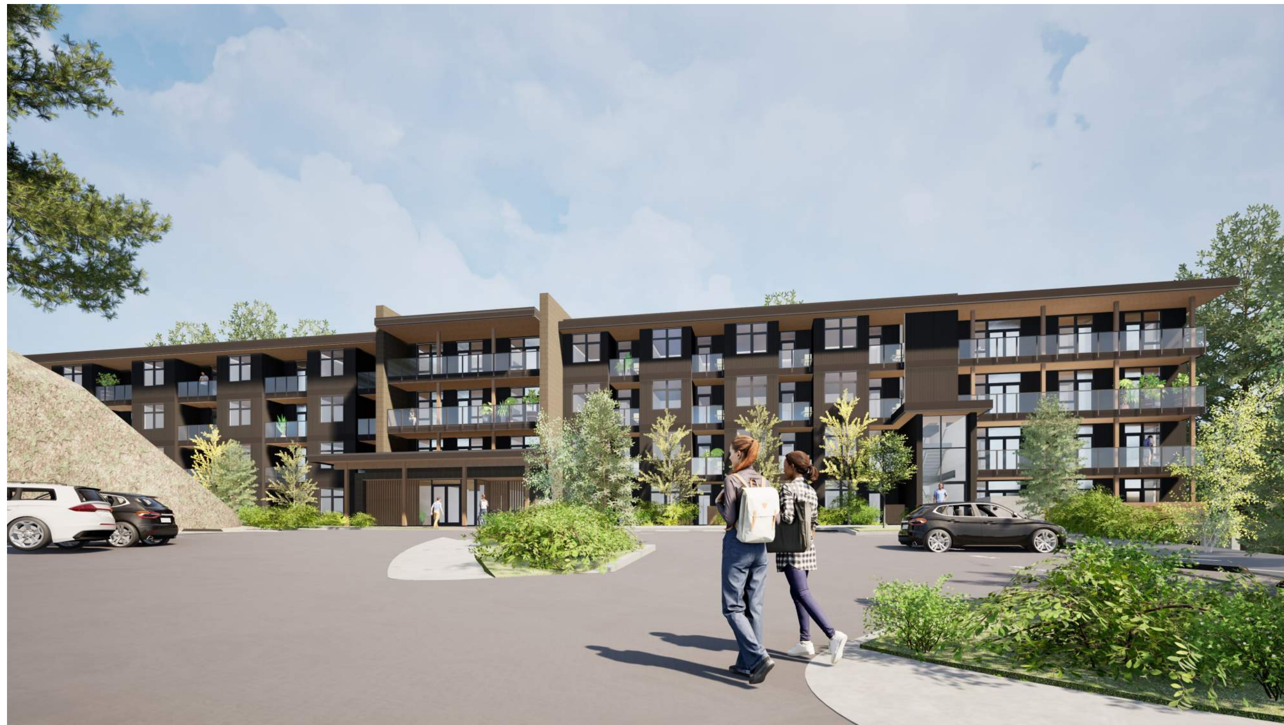
RENDERING OF SOUTH BUILDING ELEVATION AND FORECOURT